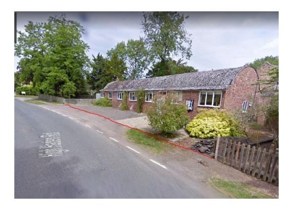
Planning & Design must be consistent with The UK Government's National Planning Policy Framework (NPFF) and relevant planning practice guidance.

Recent communication from Cambridgeshire County Council Highways Department has confirmed that part of the parking area to the west of the building has public access, it being a continuation of the pathway to the north to the grassed pathway to the south of the hall on land adjacent to the property to the south of the hall. This area is depicted in the photo provided by Highways below. The public access (pathway) between the High Haden Road and the red line annotated on the photograph below. Guidance is that this area should be left clear of vehicles (parked or otherwise) for public access and that reducing available parking allocation would be unlikely to meet with planning approval. The area laid to slab however, is not considered to be available for parking. GVH's best assessment is that HDC Planning authorities will insist that there is no reduction in the number of car parking spaces.