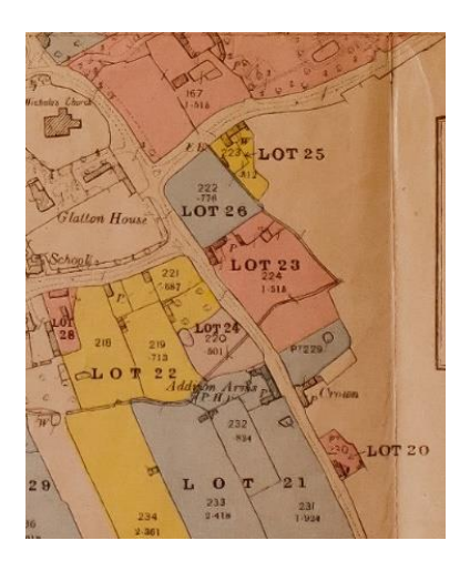
St Nicholas' Church The Parish Church of St Nicholas lies at the heart of the village and was recorded in the Domesday Book. The Church is of considerable architectural interest and is a Grade 1 listed building.